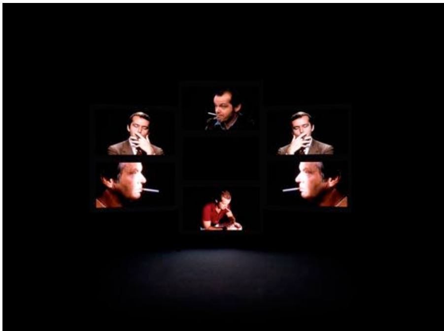
'Him' from Him + Her